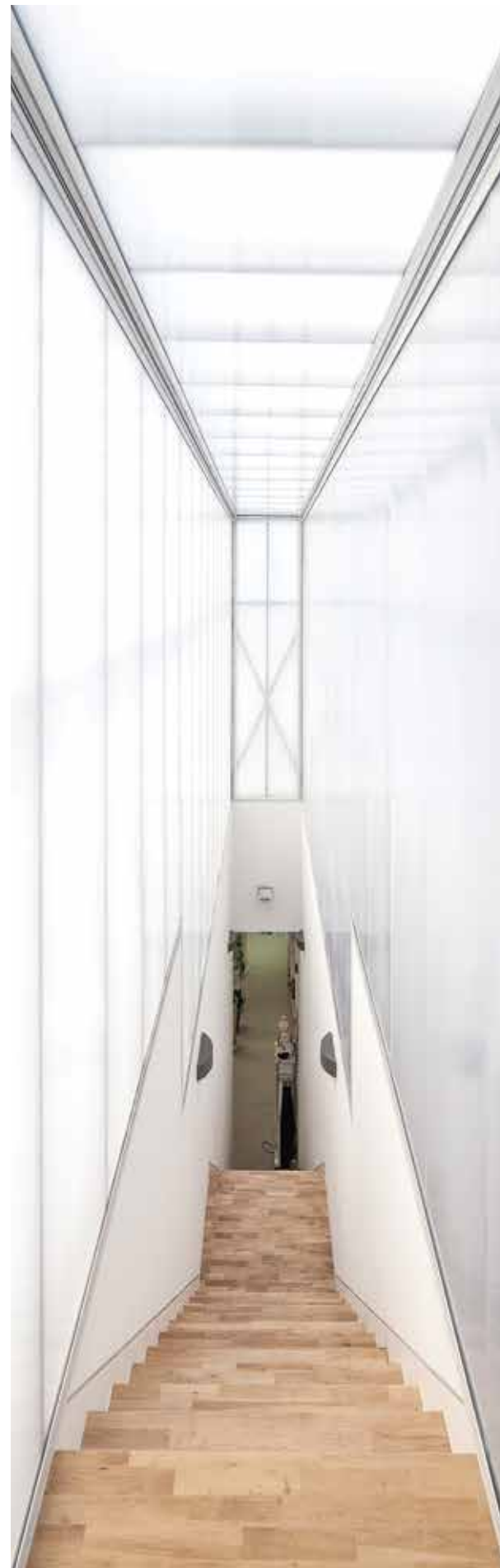
Seosan Hori Neighborhood Facilities, Korea | Danpal® Interior Partitions System 10mm | Architect: Cornerstone Thing Chusa