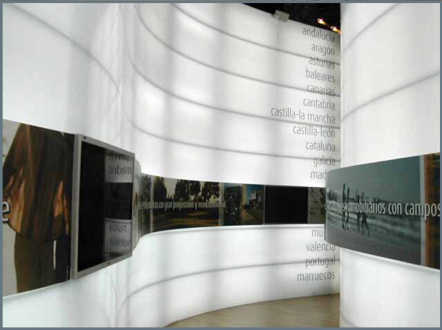
Dauphine University, France Danpal® Interior Partitions System 16mm Architect: SCP Beguin & Macchini, D.E.N.S.A.I.S Architectes

feel to a wall, create a unified look or add screen prints or shadows. Our extensive range of lighting options, textures and reflections offer architects a rich palette for creating unique spaces, increasing the depth and illumination of the user's experience.