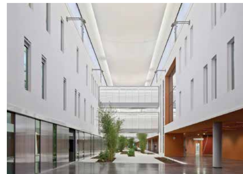
Corporate Offices, France | Danpal® Interior Partitions System 16mm