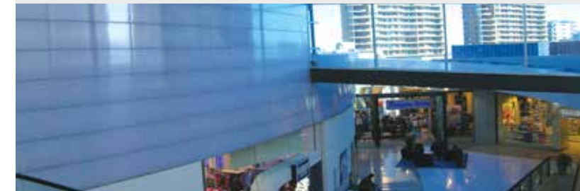
Westfield Shopping Center, Australia | Danpal® Interior Partitions System 16mm